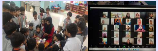
Trainee with students (Left), Virtual Exchange with Lone Star College, Houston, US (Right)