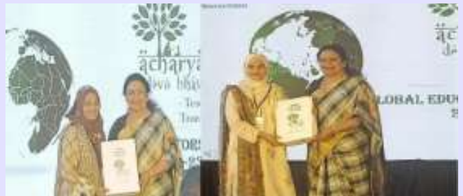
TTC ex- trainees selected as Teachers as transformers