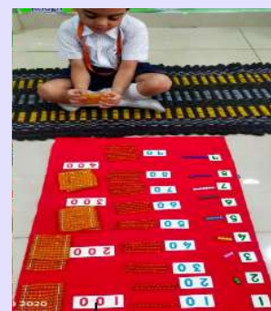
Enhancing numerical skills with Montessori beads