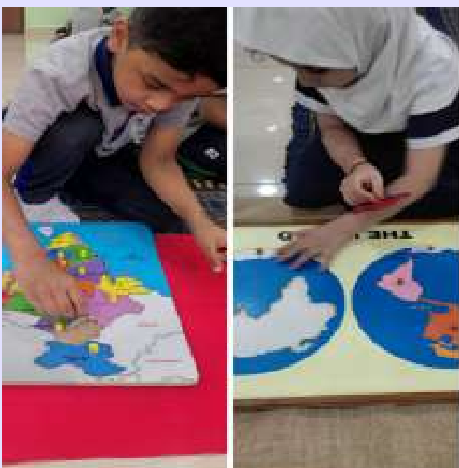
Learning geography with Montessori Maps