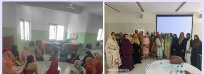
Therapy Session (Left), PAT FEST at Osmania University (Right)