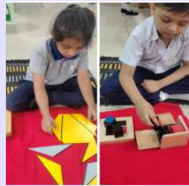
Learning geometry with Montessori constructive triangles and binomial Cube

In Montessori classrooms children make creative choices in their learning which helps in holistic development. The self learning material ensures that the concepts are well learnt and the confidence of the child remains high. Here are samples of activities that the children chose to do in our Montessori class.