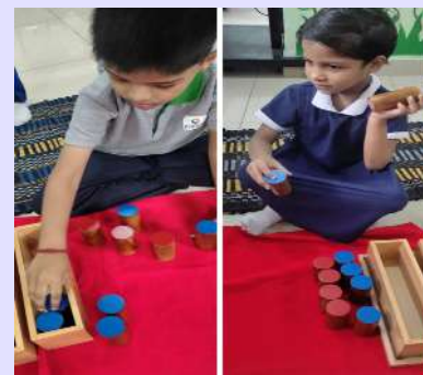
Enhancing sensorial skills with Montessori Sound boxes