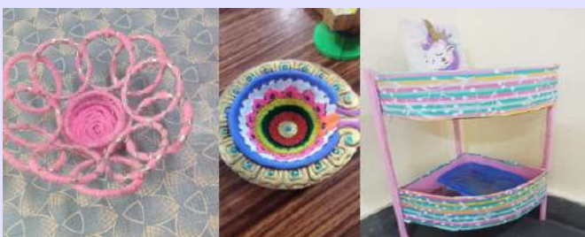
Decorating the diyas & Storage holder