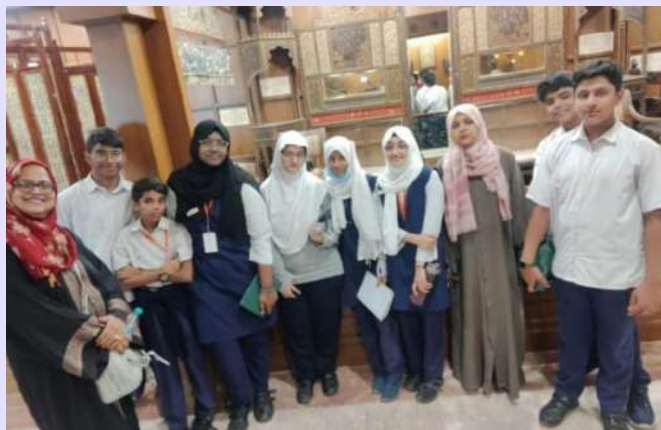
Trip to Salarjung museum

At Focus High School, we have learnt discipline and strength of character. Our field trips expose us to the world beyond our reach. Apart from intellectual growth our school focuses a lot on mental health. Guidance for our future is given through Career Counseling sessions. These classes give us realistic achievable goals that we can strive towards.