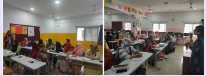
ECE Session (Left), English Communications Session (Right)

We also want to change the perspective of the society that not anyone can become a pre-primary teacher. Teaching is a vocation that requires skills and training. To become an efficient teacher a person must have that calibre, knowledge & patience and a feeling of happiness to make students a better human being. This training allows teachers to discover their purpose in life and take action towards achieving their dreams- which might or might not be teaching.