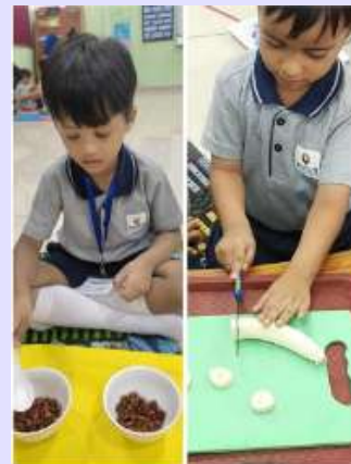
Learning to be independent with practical life activities