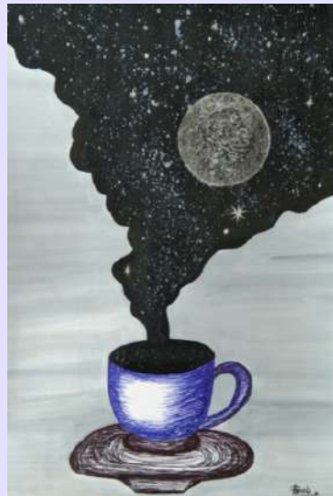
Zainab Ali, C10

Students show keen interest in activities related to arts which encourages me to plan and implement new arts activities for them in each class. Few students come up with their own art work which I display as motivation for other students. Children enjoy art work. To keep them away from art is not healthy. It helps them perceive colours, shapes, forms and develops aesthetic sense. I had the joy of teaching emboss painting, glass painting, pot painting, to the students. I feel happy when children come running to art class. Art is a therapy. It works wonders for their own development. It allows them to express their creativity, emotions, and they become imaginative.