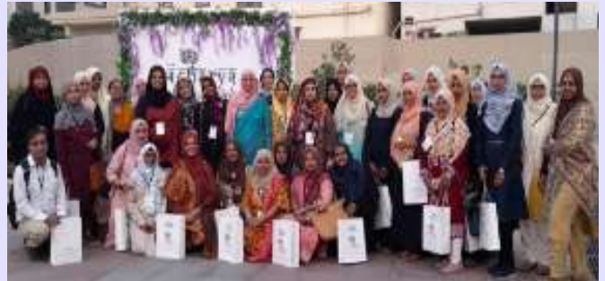
PP teachers & trainees at The SHRI RAM ACADEMY