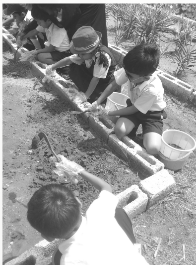
Class 1: Fieldtrip to Active Farm School, Gachibowli