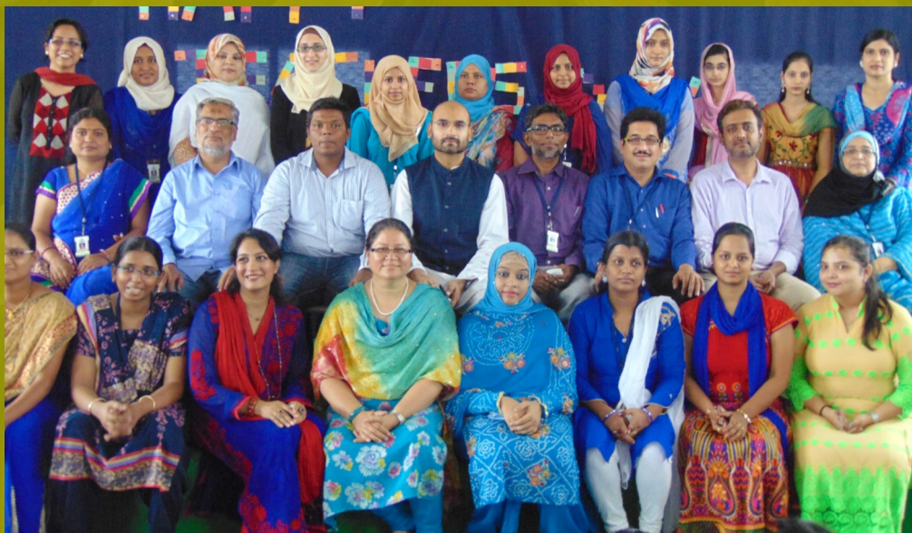
Best wishes from the devoted FHS family