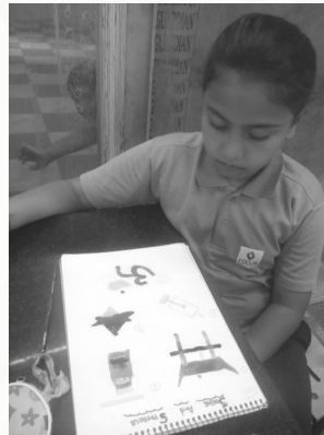
Class 5: Designing 3D symbols with colour chart papers in Rangostav Colour and Writing Competition