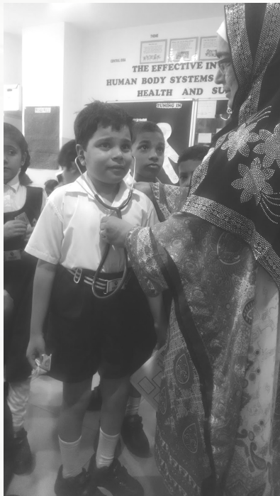
Class 3: Inquiring how body systems work