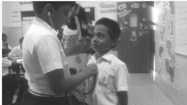
Class 3: Inquiring how body systems work