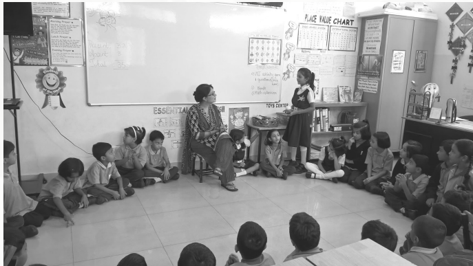
Class 2: circle time and class discussion